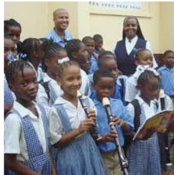
Children at St. Andrew's Roman Catholic School in Grenville play with recorders donated by a member of the International Fellowship of Rotarian Musicians.